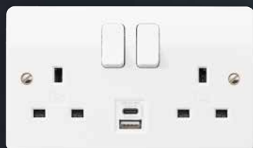
K2766WHI / K2766RPWHI (Retail only)

Choose from our classic white or graphite grey finish, each with a double pole, dual earth design and covered by a 5-year MK guarantee.